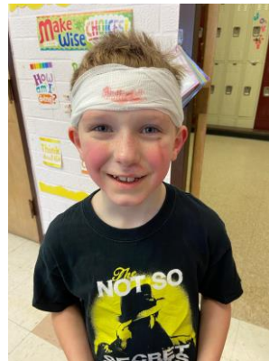
Tuesday - Fake an Injury Day