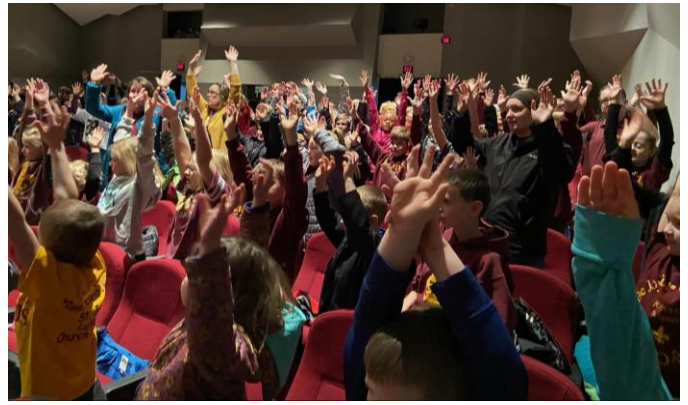
Monday - the concert at Mayer