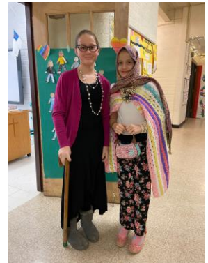
Wednesday - Dress like an Elderly Person