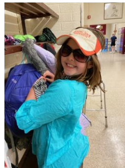
Thursday - Beach Day